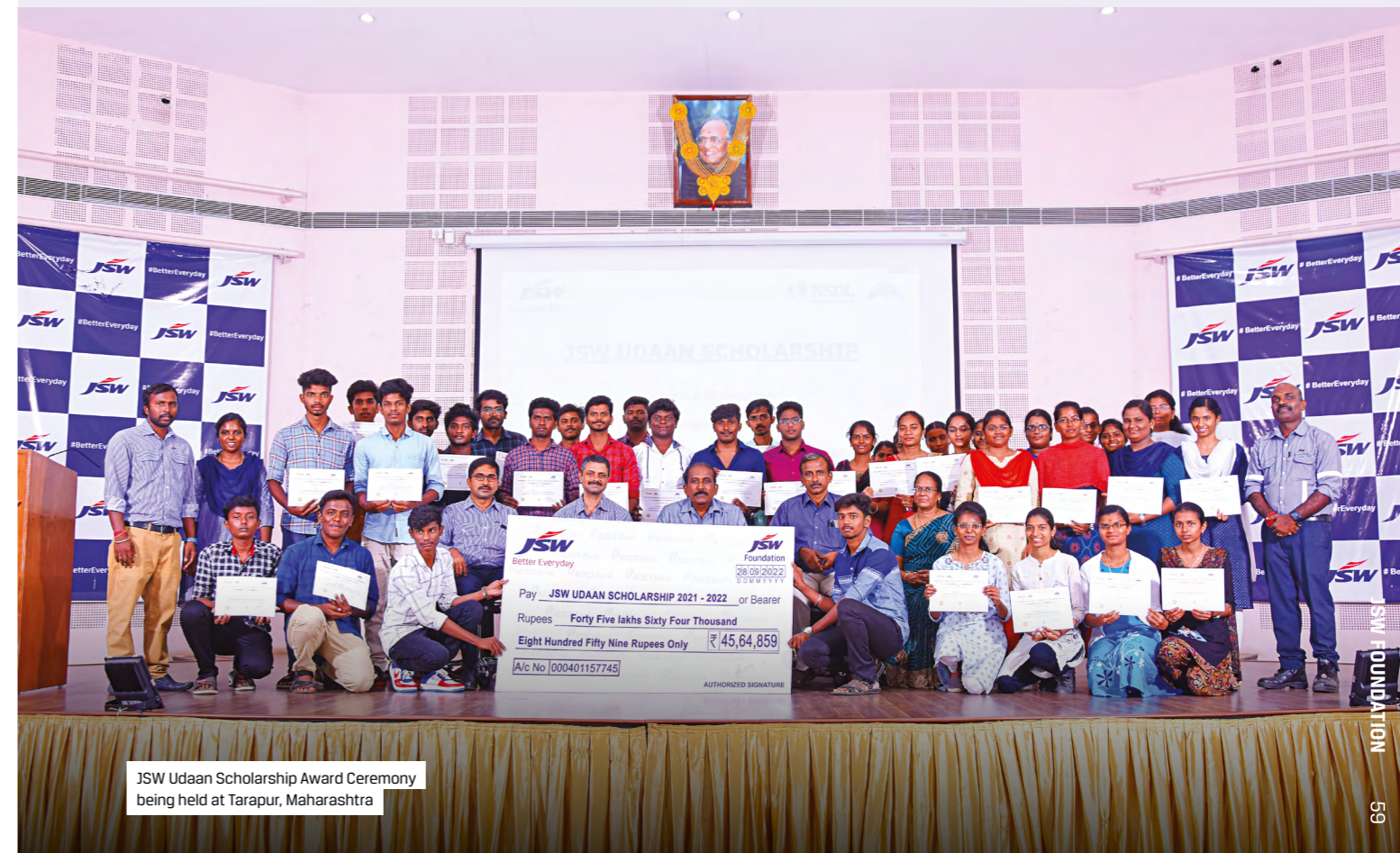
JSW Udaan Scholarship Award Ceremony being held at Tarapur, Maharashtra