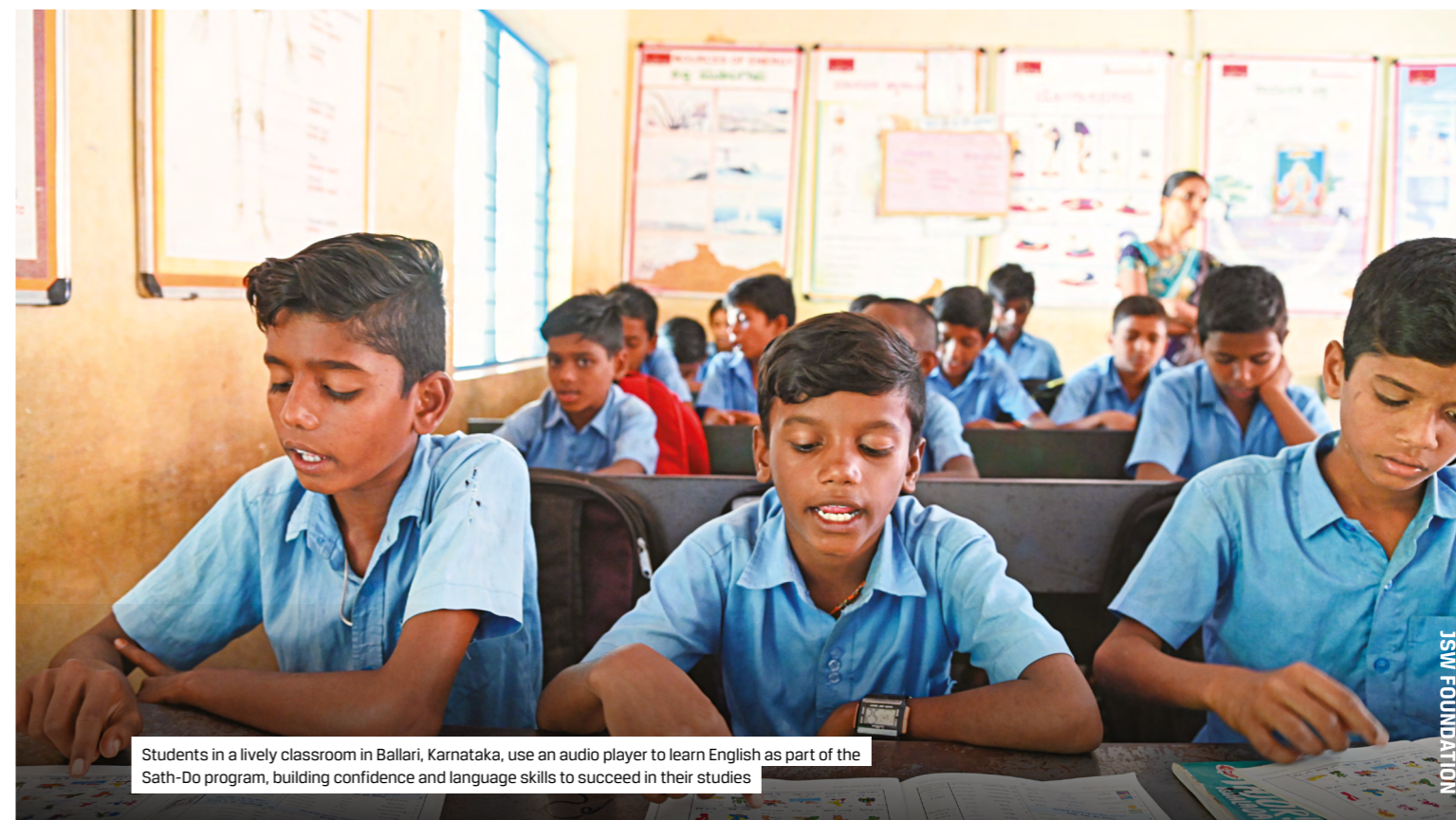
Students in a lively classroom in Ballari, Karnataka, use an audio player to learn English as part of the Sath-Do program, building confidence and language skills to succeed in their studies

effect, it is instilling the necessary skills in government teachers to make classes fun and playful so students can build their skills in reading, comprehension and conversation. The goal is for English learners to love learning and feel confident speaking or reading.