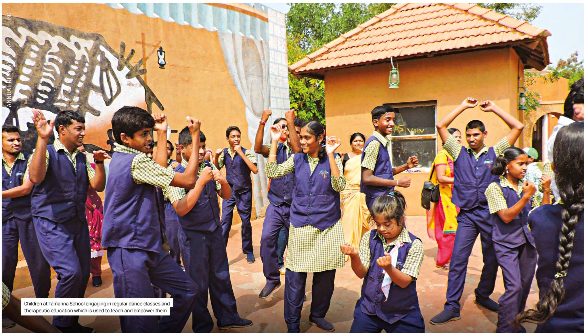
Children at Tamanna School engaging in regular dance classes and therapeutic education which is used to teach and empower them

117 Specially-abled students benefitted through Tamanna School