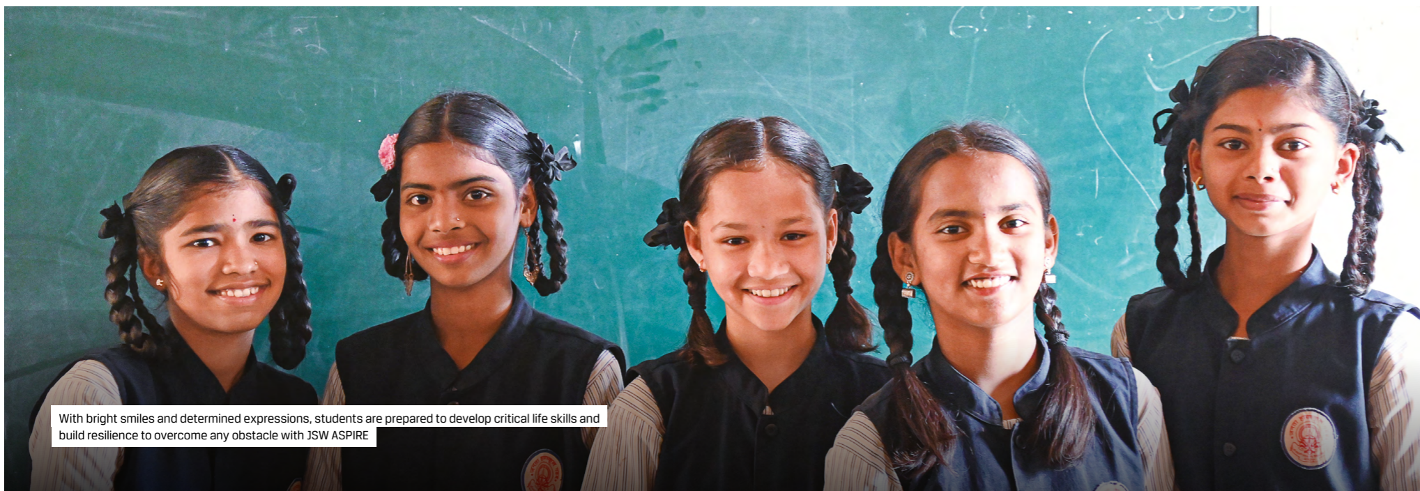
With bright smiles and determined expressions, students are prepared to develop critical life skills and build resilience to overcome any obstacle with JSW ASPIRE