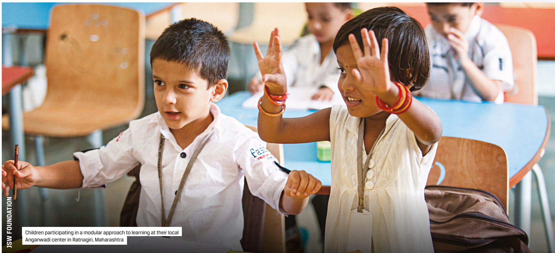
Children participating in a modular approach to learning at their local Anganwadi center in Ratnagiri, Maharashtra