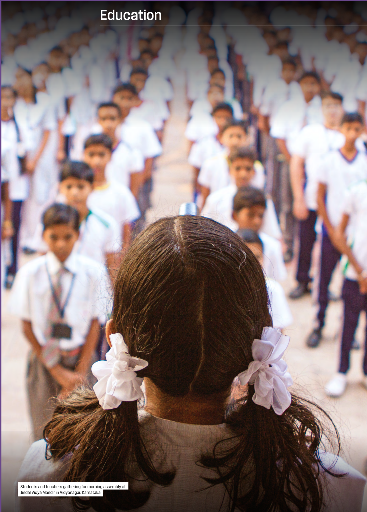
Students and teachers gathering for morning assembly at Jindal Vidya Mandir in Vidyanagar, Karnataka