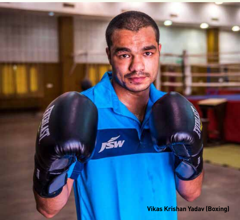
Vikas Krishan Yadav (Boxing)

JSW-SEP's wrestling portfolio is one of the strongest and with multiple World Championship medalists; it is one of the most exciting disciplines that the program supports. At the end of August, JSW-supported Bajrang Punia and Babita Kumari were honoured with the Arjuna Award commemorating a wonderful year that both wrestlers have enjoyed. Amit Kumar and Bajrang lead the charge in the men's section having shown