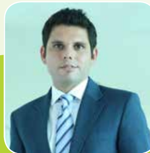
Mr. Mustafa Ghouse

Games and World Championship medalist was the first Indian woman wrestler to qualify for the Olympic Games, appearing at the 2012 London edition. Her sister Babita has come up fast over the last couple of years, winning a host of international medals. Vinesh Phogat, a cousin of the Phogat duo is another rising star, having already accumulated a Commonwealth Games gold medal and an Asian Games bronze medal in 2014. Sakshi Malik, Navjot Kaur and Geetika Jakhar, all three picked up medals in Glasgow and complete what is a power-packed wrestling contingent at the JSW-SEP.